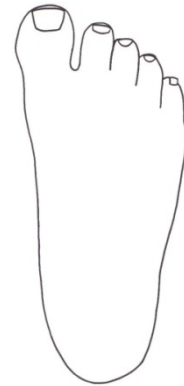
TOP OF FOOT