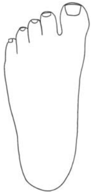
TOP OF FOOT