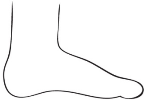
INSIDE OF FOOT