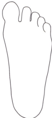
BOTTOM OF FOOT