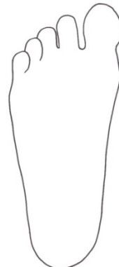
BOTTOM OF FOOT