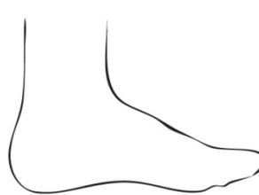
OUTSIDE OF FOOT